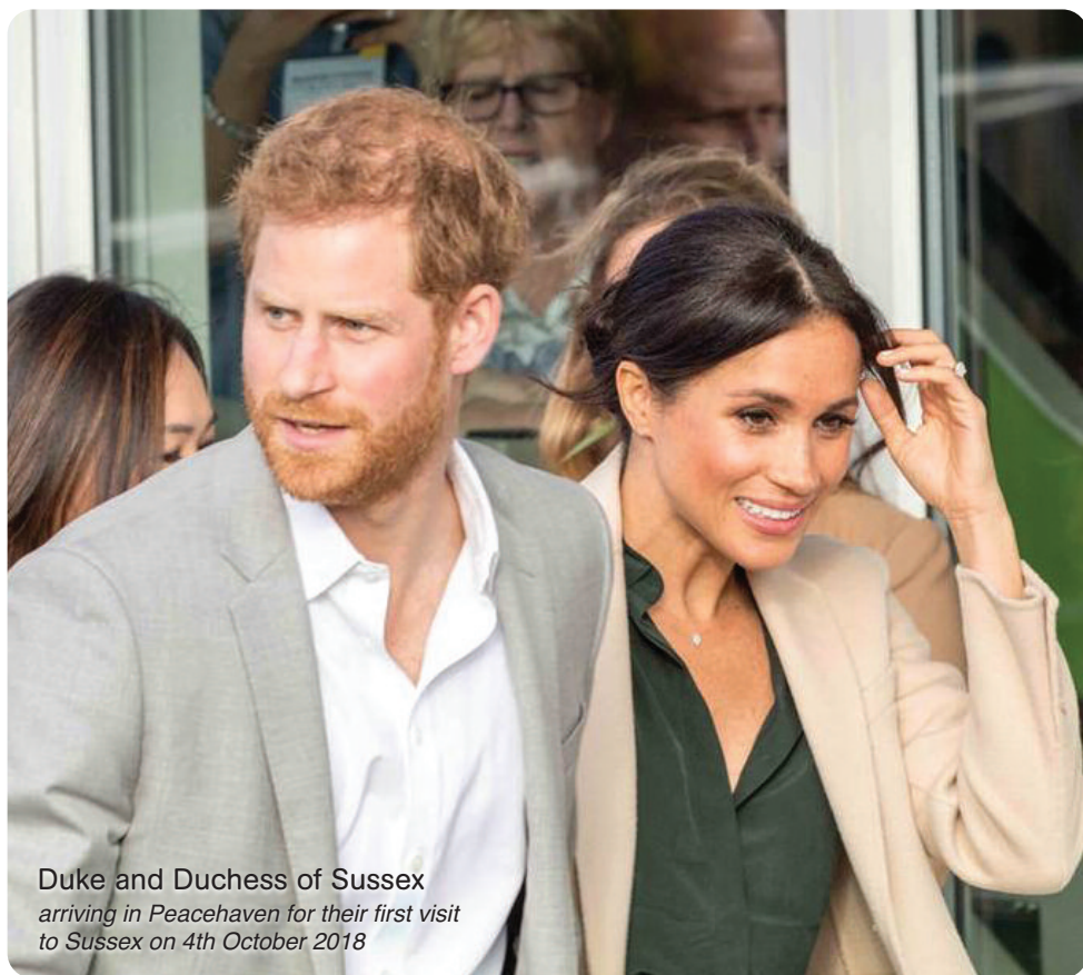
Duke and Duchess of Sussex arriving in Peacehaven for their first visit to Sussex on 4th October 2018

Have Your Say • Get Involved • Make a Difference • Shape the Future