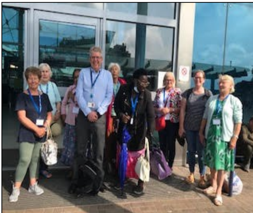
Hope G's Train Trip to Tunbridge Wells